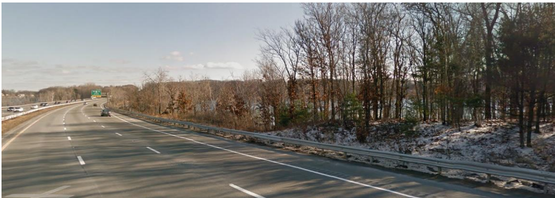
Figure 1 – Incident location and surrounding area

7. Commercial Driver License Manual, 2005 CDL Testing System (July 2014). www.massrmv.com/LicenseandID/DrivingManuals/CDLManual.aspx . Date accessed: 12/22/2016.