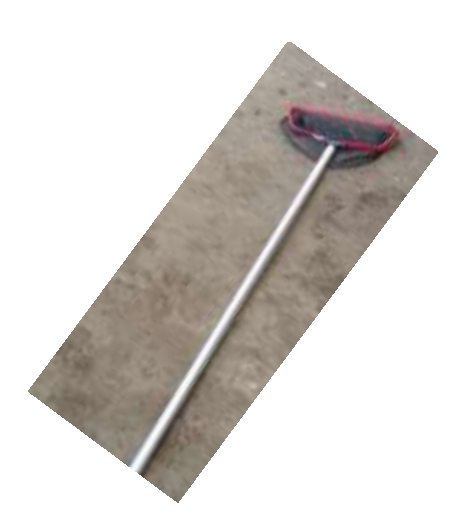
Exhibit 4. Poled net used for paddling the boat