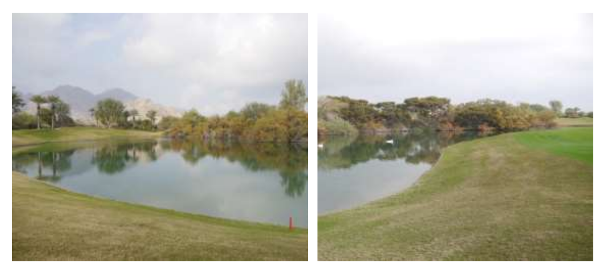
Exhibits 1 & 2: View of lake where the fatality occurred (landscape view not to scale; photo taken when lake was free of vegetation).

The incident scene was a 4.5-acre golf course lake (Exhibits 1 & 2). The lake served as an irrigation basin, receiving run-off water from an adjacent canal. Water from this lake flowed out through a pipe to another water feature on the course. Overgrowth of lake weeds and algae peak during the summer months. The lake was reportedly thick with weeds at the time of the incident.