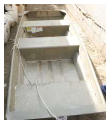
Exhibit 3. Boat used by victim