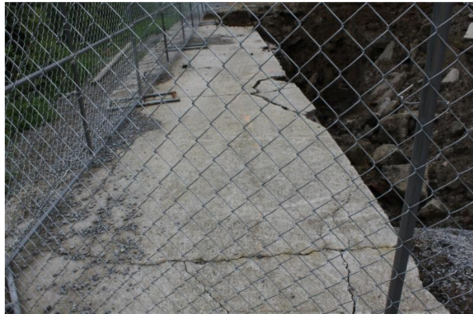
Figure 4. The parking lot surrounding the trench, with fissures and cracks.

In order to install the sewage piping, a vertical trench with a depth of 12 feet, 2 inches and an area of 5 feet by 48 feet was dug in a parking lot, 17 ½ feet away from a business. The construction company had been on the job site for two weeks and working in the trench for 3-4 days. No pre-job soil test was performed to determine what type of protective system would be necessary. The parking lot surrounding the trench showed fissures and tension cracks, as well as signs of previous excavation. The ground surrounding the trench was subject to vibration from heavy equipment and an active railway was located 34 feet away from the side of the trench away from the building. The foreman rented a trench box with a wall measuring 8 feet tall and an area of 2 feet and 1 inch wide and 16 feet long from a local equipment rental company. When placed into the trench, the trench box was 4 feet and 2 inches below the grade of the vertical walls of the trench.