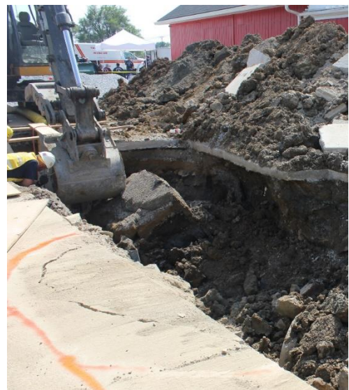
Figure 1. Trench following the rescue efforts.