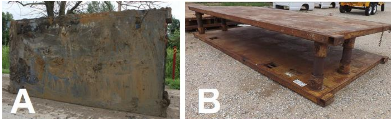
Figure 3. A) Trench box used to protect the workers, the walls of which were 4 feet and 2 inches too short for the job; B) stock photo of the type of trench box used, side angle view.

Although the workers used a trench box, it was not tall enough for the trench. The trench was 12 feet and 2 inches deep, while the trench box measured only 8 feet tall. This left the construction laborers inside the trench vulnerable to 4 feet and 2 inches of exposed wall.