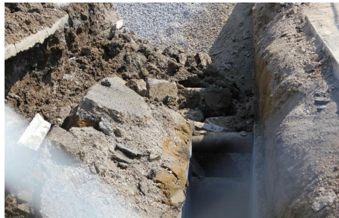
Figure 4. The trench following the collapse.

On the day of the incident, two of the construction laborers had been laying pipe in the trench for approximately 6 hours. At 2:20 pm, a large section of the trench edge broke off, dumping a portion of the spoil pile and concrete into the trench on top of both construction laborers. The victim was completely buried, while the other construction laborer was trapped from his waist down. Emergency Medical Services (EMS) was called at 2:22 pm and one of the construction crew members climbed into the trench and attempted to free the trapped construction laborers. A special rescue trench team arrived at 2:30 pm with EMS and began the rescue and recovery process. The construction laborer who was trapped from the waist down remained calm and responsive during the four and a half hour extraction process until he was freed at 6:55 pm and taken to a local hospital for treatment of his injuries. The victim's body was recovered two hours later at 8:55 pm. He was pronounced dead at the scene due to traumatic asphyxia and blunt force injuries of the head, neck, and torso. It is unknown how long the victim was buried beneath the debris before succumbing to his injuries.