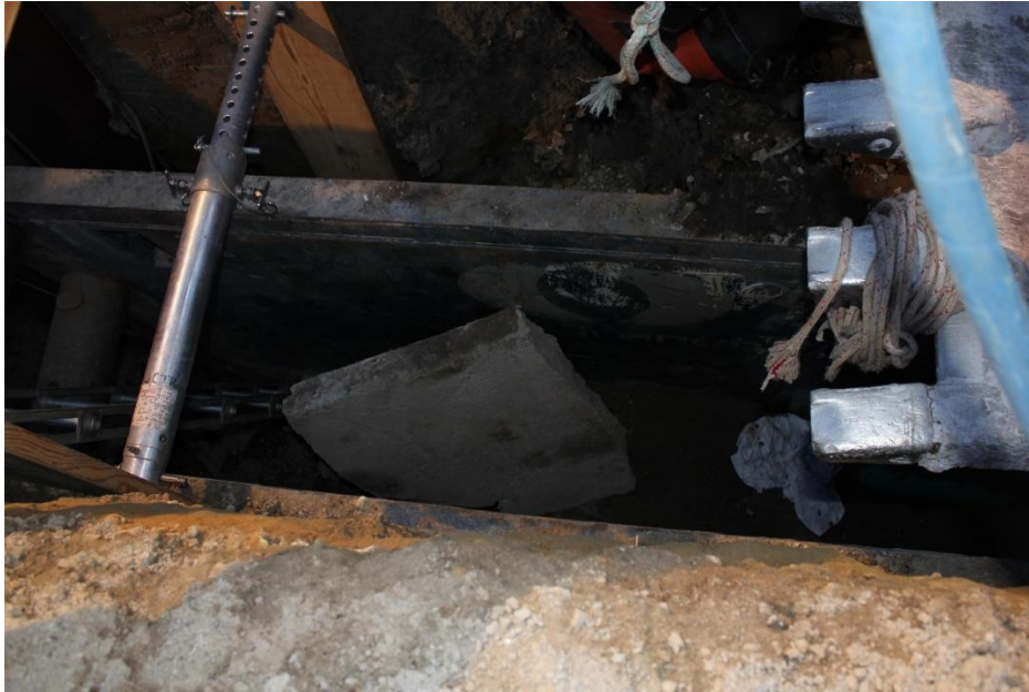
Figure 5. The trench during the rescue and recovery process.