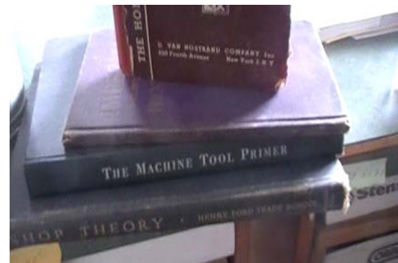
Figure 3. Examples of books ordered by the decedent