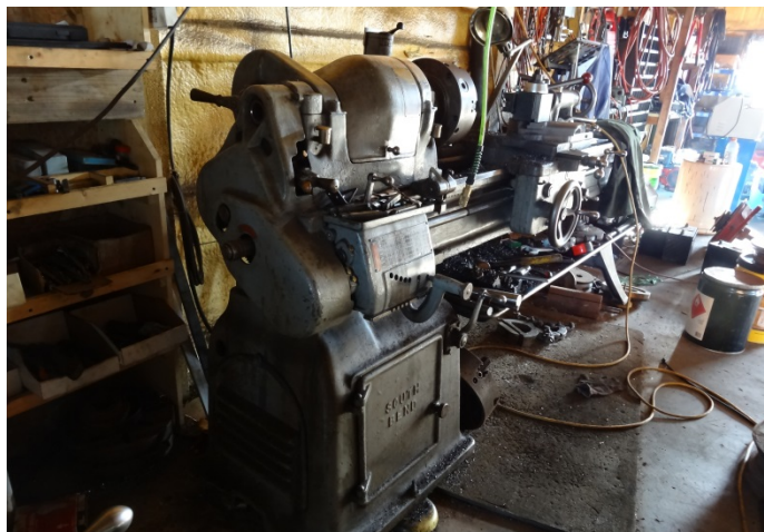
Figure 4. South Bend lathe position in shop

The location where the lathe was placed was congested and dimly lit. The decedent had placed the lathe near a shelving unit on the wall and close to the mill. The headstock side of the mill was within one foot of the shelving unit. (See Figures 4 and 5).