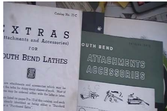
Figure 2. Examples of manuals ordered by the decedent

The decedent was a general laborer/repair technician at his family-owned business. He was the son of the owner and one of four employees. The decedent worked full time for the past 10 years. His normal work hours were "whatever it took to get the job done" according to the interviewee. The decedent bought the lathe and a mill at an auction and installed them side by side in the company shop approximately four years ago. He was the only individual who operated the lathe and the mill. The decedent did not receive formal training on the lathe, he was "self-taught". The decedent ordered and studied the operator manuals and other metal cutting books for his education (See Figures 2 and 3). He also received informal training from a "machinist" who was