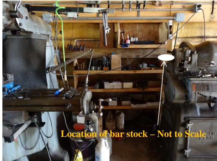
Figure 5. Position of lathe, mill, and shelving unit containing decedent's tools.

A coworker was approximately 30 feet away inside the garage and the decedent's father was just outside the garage door at the time of the incident. The coworker heard a noise, looked over and saw the decedent caught in the bar stock, his shirt entangled, and tightened around the decedent's neck. He ran outside and informed the decedent's father, who instructed him to shut off the generator which powered the unit. Together they worked to disentangle the decedent's shirt from the bar stock by reversing the bar stock and then lowered the decedent to the ground. Emergency