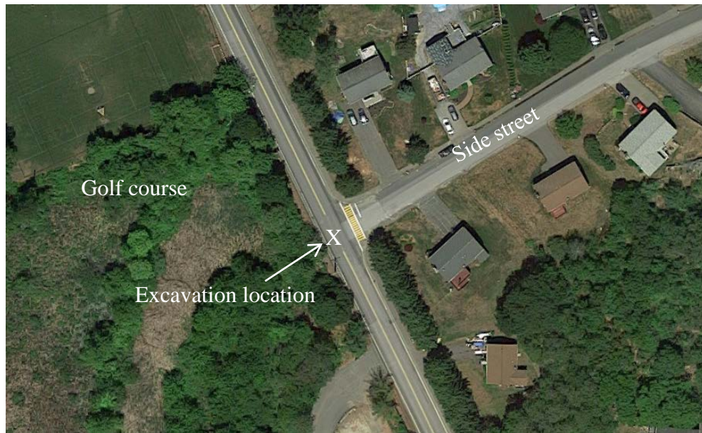
Figure 2 – Roadway view of the T-shaped intersection with excavation location outlined