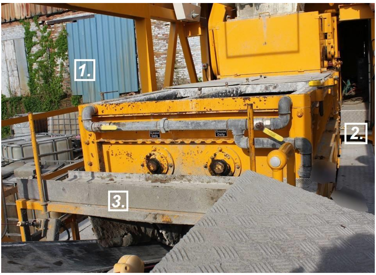
Photo 2: One walking platform on each side of the mixer, and a third elevated platform directly over the conveyor belt that connects sides 1 and 2.