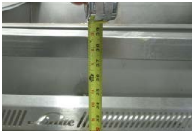
Figure 3. Top rail height on platform. It's not known how the victim entered the vat, but evidence suggests that he fell over the railing.