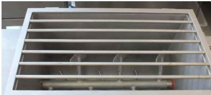
Figure 5. Example of guard for blender/grinder to prevent access to moving parts but allow cleaning.

Recommendation # 2: Host employers should establish routine procedures for communicating and reviewing hazards in their work environment and control methods with contractors.