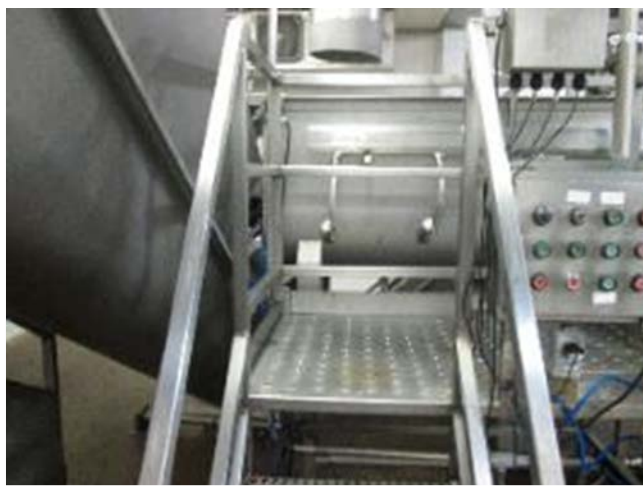
Figure 2. Platform to access the top of the blender vat.

On the evening of the incident, the Hispanic contract workers began arriving around 9:00 pm and assembled in the lunch room until all production activities were completed. The worker reported to work around 9:30 pm. Co-workers who saw him did not observe anything out of the ordinary about his demeanor or approach to work. Each member of the cleaning crew was assigned to clean and sanitize specific equipment (e.g., blender, conveyors, and augers). The industrial blender that he