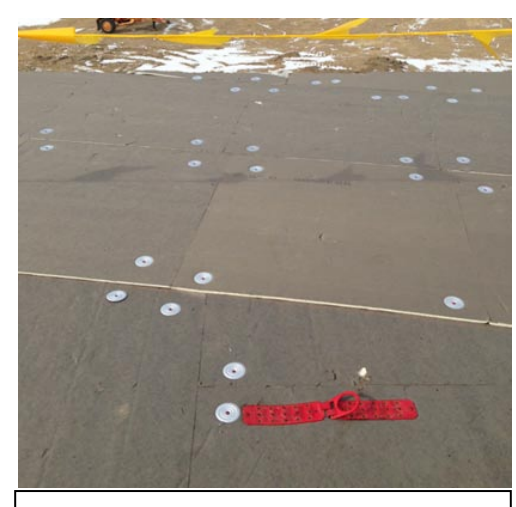
Figure 3. Roof anchor located inside of the warning line on northwest roof corner

Three days prior to the incident, the firm had completed work on the main roof level. Work ended that day due to inclement weather. Work began the following Monday on the lower roof level. There was a 4-foot difference in height between the two roof levels. The firm did not have a tool box talk the day of the incident. Workers moved the warning lines to the approximately 65-foot by 75-foot lower roof, leaving a range of six feet to 16 feet away from the roof edge. Spacing between the