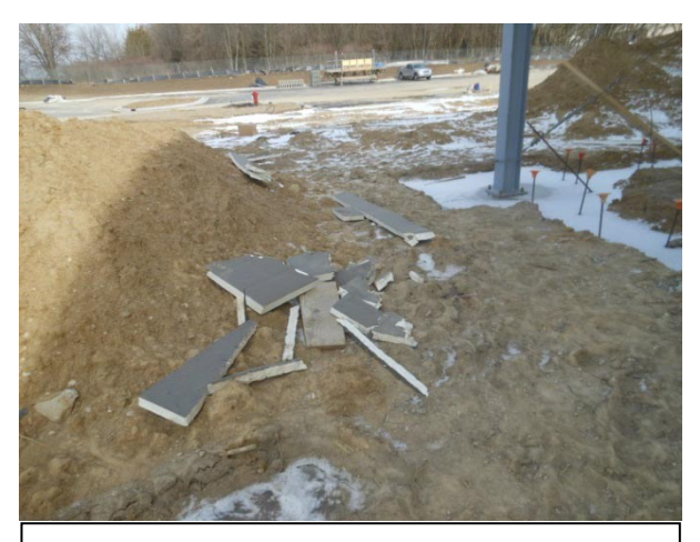
Figure 5. Two-inch rigid foam insulation which broke when decedent stood on it

Shortly after Coworker 1 left the roof, the decedent apparently wanted to help Coworker 1 finish trimming the insulation. With his harness in a bucket within the warning line area on the roof, the decedent proceeded outside of the warning line (Figure 4). Coworker 2 was on the roof working near the decedent. "Out of the corner of his eye", he saw the decedent stand up and unknowingly step onto a piece of tapered insulation that extended past the roofline. The cantilevered insulation was unable to support the decedent to fall approximately 26 feet to the frozen ground below (Figure 5).