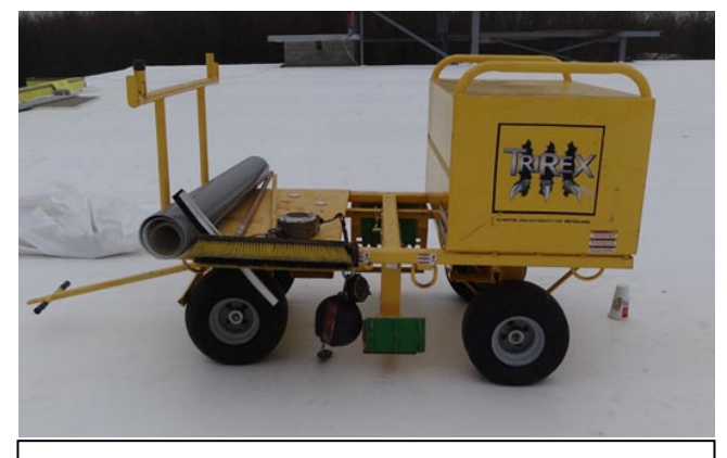
Figure 2. Fall arrest cart located on upper level

On site, the firm had a mobile fall protection cart which had locking pins for the wheels so it could be utilized on different sections of the roof (Figure 2). Additionally, the firm used a reusable roof anchor designed for use on steel roofs of 24-gauge or thicker if mounted with a minimum of 10 #8, ¾-inch long sheet metal screws per side on raised ribs of roof panel with pull in the long axis (Figure 3).