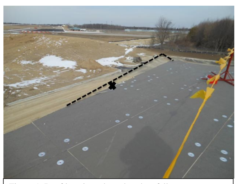
Figure 1. Roof location where decedent fell

In the winter of 2013, a male roofer in his 40s died when the cantilevered 2" rigid insulation he stepped on broke, causing him to approximately 26 feet to the frozen ground. The firm had a fall protection program including a safety monitor, warning line, and personal fall arrest system (PFAS). The dual foreman had responsibilities: installing insulation and acting as the warning line's safety monitor. The decedent was not wearing fall protection while working