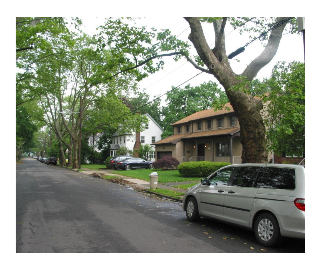
FIGURE 1. Incident site, a heavily treed residential neighborhood in NJ.

crew began to re-grade the soil. When finished, the slab was being walked back into place by the victim and lowered. During this time, for an unknown reason the victim knelt down, perhaps to fix part of the re-grade, and asked the skid-steer operator to raise the slab back up. As the slab was lifted, it swung and hit him in the head. The victim sustained blunt force trauma injuries, including a fractured skull. The victim died minutes after the injury. A crewman called 9-1-1 and the police arrived on the scene immediately.