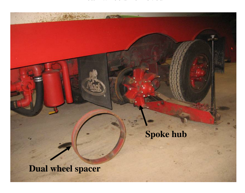
Figure 3 – Demountable rim wheel with wedge clamp