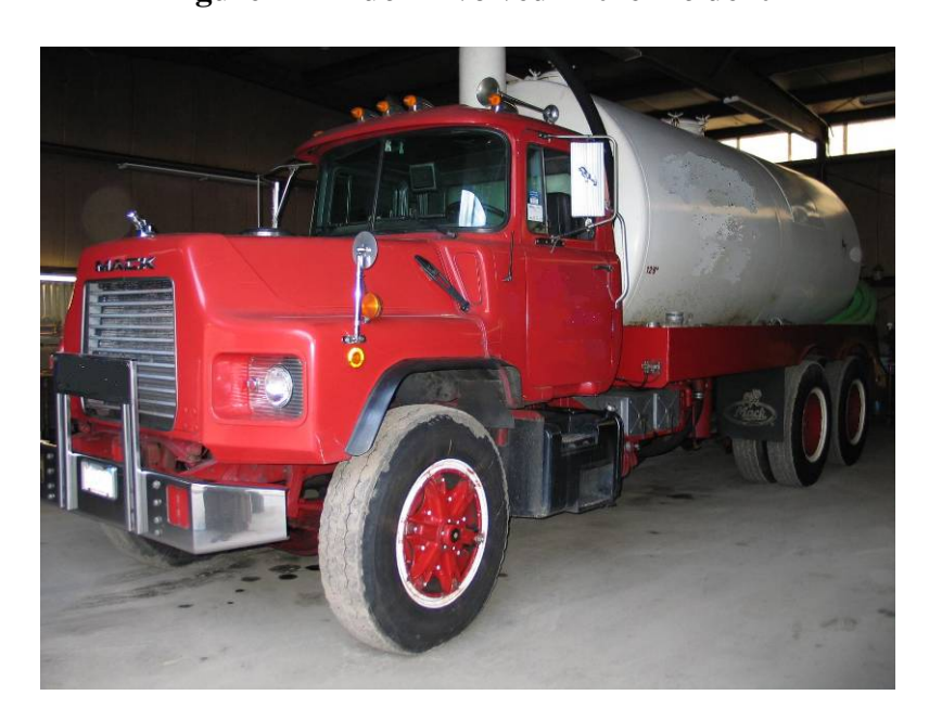
Figure 1 – Truck involved in the incident