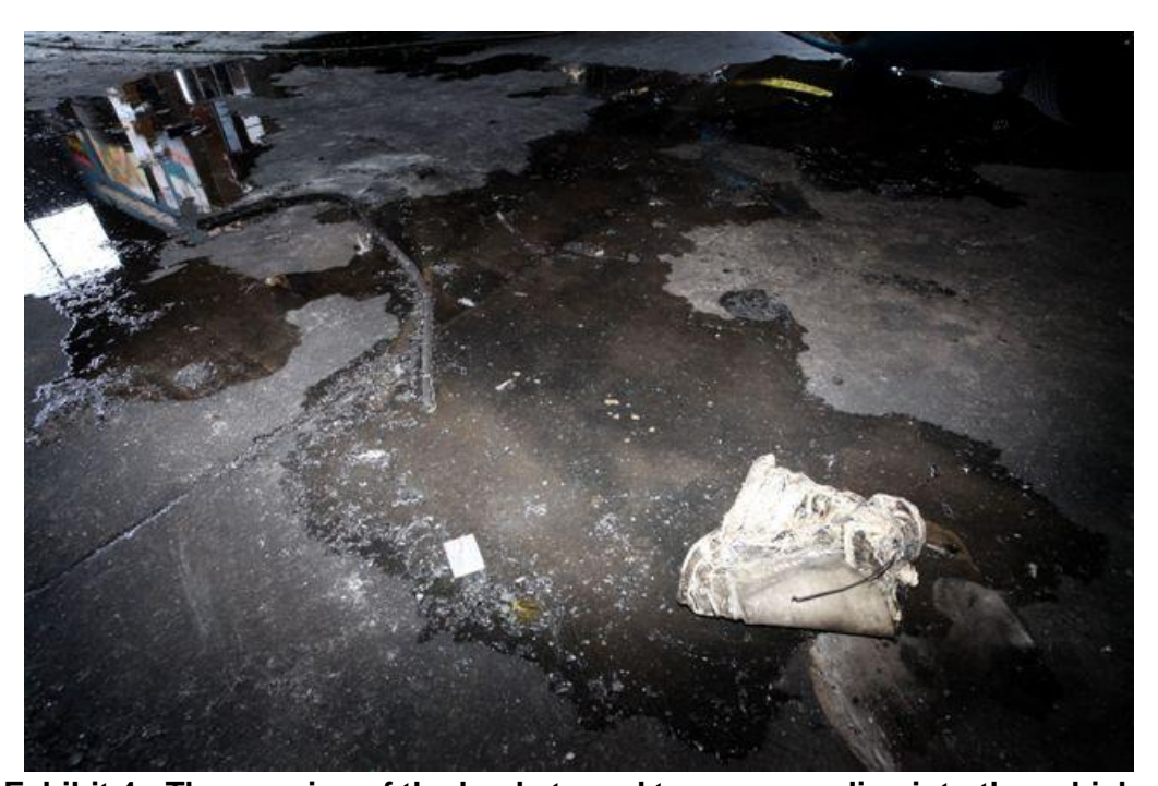
Exhibit 4 - The remains of the bucket used to pour gasoline into the vehicle.