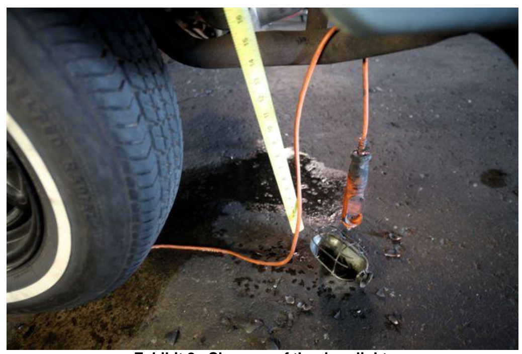
Exhibit 8. Close-up of the drop light.