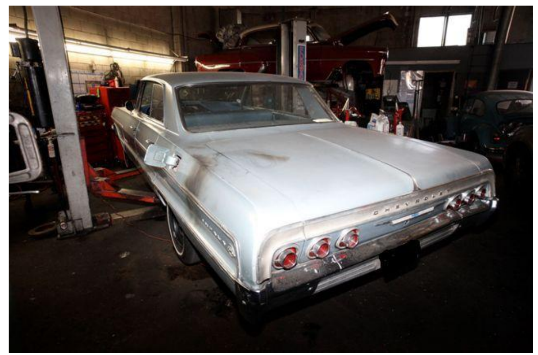
Exhibit 5 - The vehicle involved in the incident.