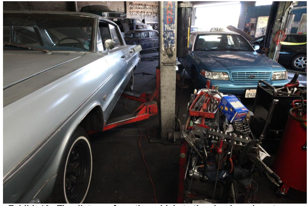
Exhibit 10. The distance from the vehicle to the shop's main entrance.