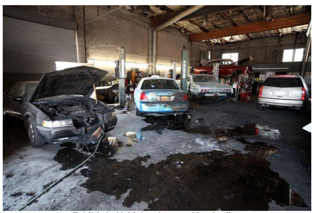
Exhibit 2. Vehicles damaged by the fire.