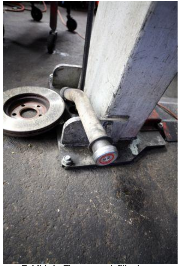
Exhibit 9. The gas tank filler hose.