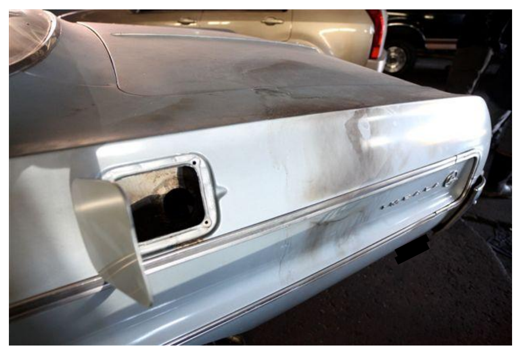
Exhibit 6 - The vehicle's fuel tank inlet.