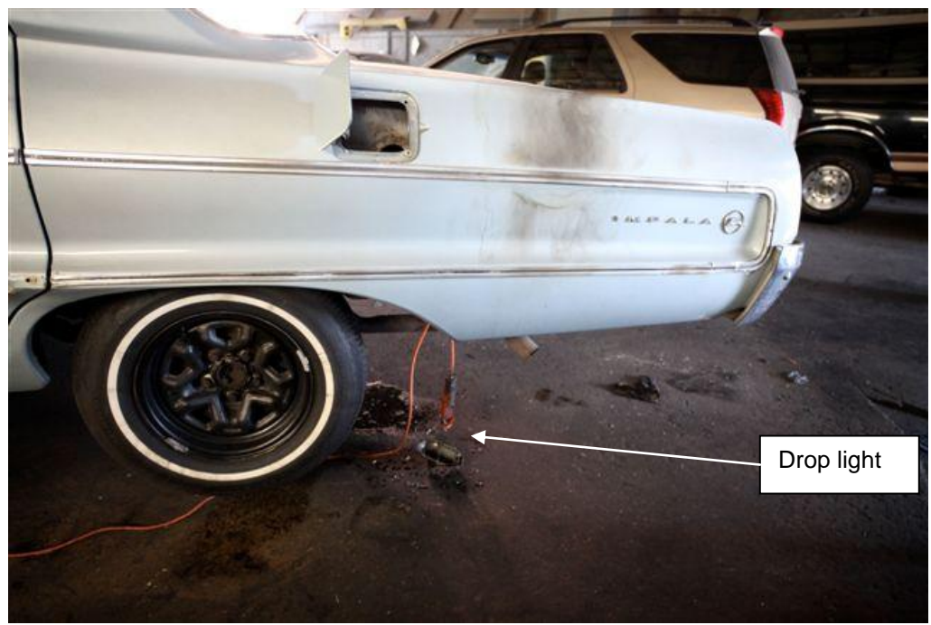
Exhibit 7. The drop light that was left hanging under the vehicle when the automotive lift was lowered.