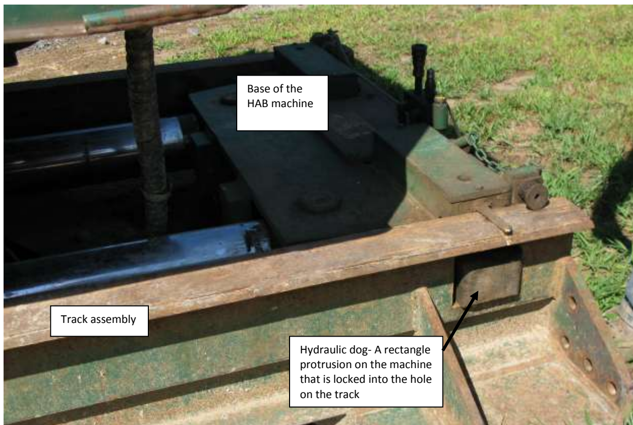
Photo 2. The HAB machine is locked to the track assembly by the rectangle protrusions engaged into the holes on the track assembly.

The machine was mounted on a track assembly comprised of two pairs of tracks connected by steel beams. The track assembly was approximately 32 ft. (9.8 m) long and 5 ft. wide. There were rectangular openings (holes) on the tracks. The base of the HAB machine had movable rectangular protrusions (hydraulic dogs) controlled by hydraulic power that can be locked into the holes on the tracks to prevent machine movement on the tracks (Photo 2). The dimensions of the machine were 60 in (1.5 m) wide, 144 in (3.7 m) long and 52.5 in (1.3 m) high. The centerline of the auger was 1.88 ft. above the ground. The combined weight of the machine and the track assembly (auger string excluded) was approximately 15,800 lbs. (7,167 kg).