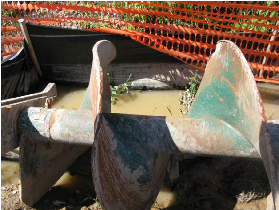
Photo 3. The bent auger blades indicate that the auger was caught by the spoils inside the casing.

The post incident examination found that the HAB machine was operational resulting in no functional damage from the incident and the auger string was not out of alignment. The blades of the auger were bent during the incident (Photo 3) according to the owner of the company. It appeared that the auger was jammed by the spoils inside the casing. According to the OSHA investigation, there were rocky materials in the area being bored and large boulders and cobbles inside the pipe casing when the auger string was removed. The throttle position indicated that the machine was operating at or near full power when the machine overturned.