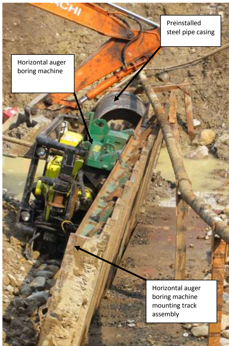
Photo 1. Accident scene: the horizontal auger boring machine overturned to its left side.