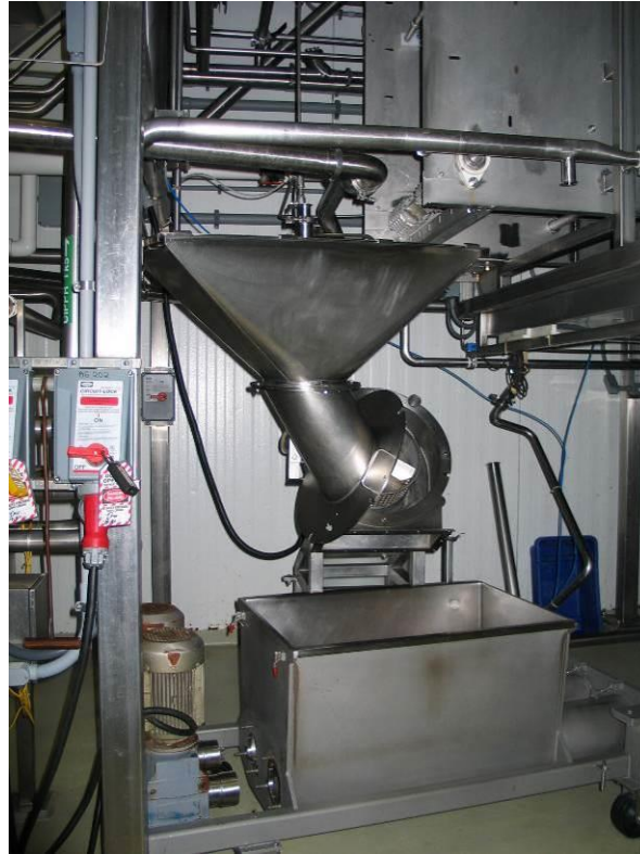
Figure 2 – The feed pump skid augers and lid