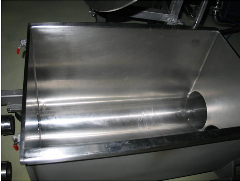
Figure 4 – The feed pump skid circuit shut off that is locked and tagged out after the incident