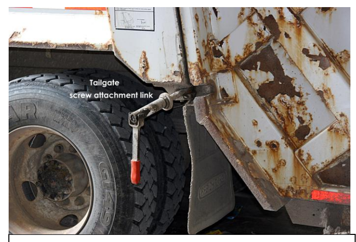
Exhibit 2: Attachment link that secures tailgate in closed position

After the links are unsecured, the driver operates hydraulic controls that raise the entire tailgate, swinging it upward (Exhibit 3). The hydraulic tailgate controls are located on the exterior of the truck to the rear of the driver side of the cab. A vertical hydraulic ejector panel inside the front body of the truck then pushes contents out the back of the truck (Exhibit 3).