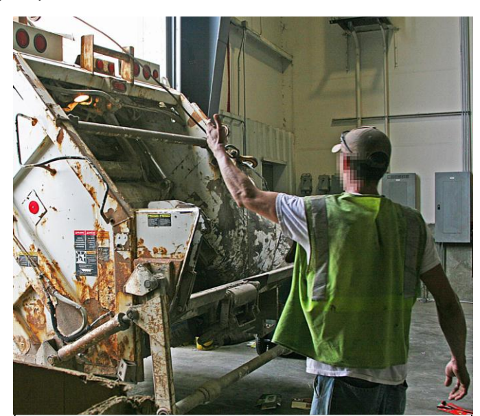
Exhibit 5: Spotter using hand signal to direct truck into recycling center

Discussion: The company implemented a new policy after the fatality requiring that all truck traffic into the facility be directed by spotters. Several recycling center employees were designated and trained as spotters. Drivers waiting to unload must wait outside the facility for a spotter to direct their truck into the building. Spotters assure that all persons are clear of the restricted area during unloading. Spotters give drivers clearance to proceed with all unloading activities and maneuvers using standard hand signals. They direct the driver in entry and exit from the facility, raising and lowering the tailgate, and ejection of a load (Exhibit 5). Spotters assure that only drivers operate latches and controls involving tailgate movement.