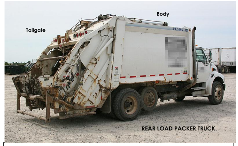
Exhibit 1: Rear load packer truck involved in incident

The victim and his partner conducted their pickup route in a 2004 rear load packer truck with 20 cubic yards capacity (Exhibit 1). On a rear load packer, the helper manually lifts and empties individual trash containers - or cardboard - into a 3-cubic-yard hopper in the tailgate of the truck. A hydraulic packer panel in the tailgate compacts the hopper contents and pushes them into the main body of the truck.