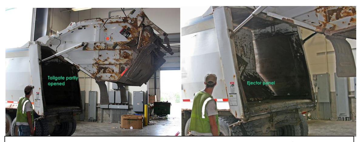
Exhibit 3: Rear-load packer truck with tailgate opened and ejector panel fully extended

After the contents are emptied, the tailgate must be lowered to a closed position and the tailgate attachments must be re-secured. When the tailgate is in any position other than fully closed, an audible alarm sounds until the tailgate is returned to fully closed position. The sound of the alarm does not change based on the movement or position of the opened tailgate. Signage is present on both sides of the truck to the front of the tailgate warning of the danger of being caught or struck by the tailgate (Exhibit 4).