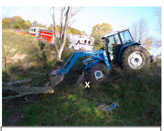
Figure 1. Position of decedent and tractor after tractor moved forward and down the embankment.

In the fall of 2010, a male farmer in his 60s died when he was pinned under the driver's side front tire of a Ford tractor Model number 7740 equipped with a loader bucket. A walking path for his pastured horses was located on a steep slope on the north side of a sand-packed driveway leading to his home. A damaged tree was close to this walking path and the decedent was concerned that, if the tree fell, it would cause injury to his horses. The decedent drove the tractor to the tree's location and stopped it with the front wheels at the top of the embankment slope. It is postulated that the decedent parked the tractor with the bucket raised slightly and resting against the tree to help direct