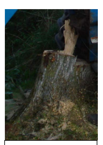
Figure 3. Locations of cuts made on tree stump

A proper notch (undercut) and back cut directs the tree's fall and the hinge wood (holding wood) keeps the tree under control and in its directed fall path. If appropriate felling techniques had been utilized, the need for the tractor/bucket would not have been necessary, and this tragedy could have been avoided.