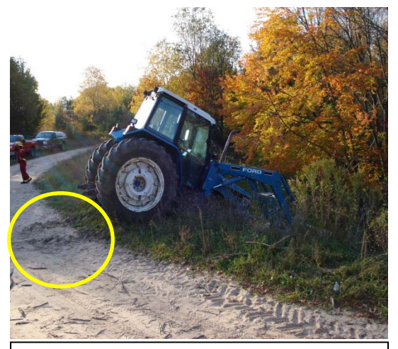
Figure 2. Driveway configuration and tractor position after moving forward when tree fell.

The decedent was facing the stump with his back to the tractor working under the raised bucket. It appears that when the decedent completed his cuts on the tree and the tree fell, the tractor rolled or fell forward over the edge of the driveway's drop off (Figure 2). The tractor tire marks are located within the yellow circle on Figure 2. The decedent, still holding the chain saw in his right hand, did not have enough time to react. The rolling/falling tractor was stopped by the stump of the tree the decedent had just cut, causing him to be pinned under the driver's side tractor tire. The