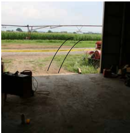
Figure 6. Path of tractor out the south door and arcing into field