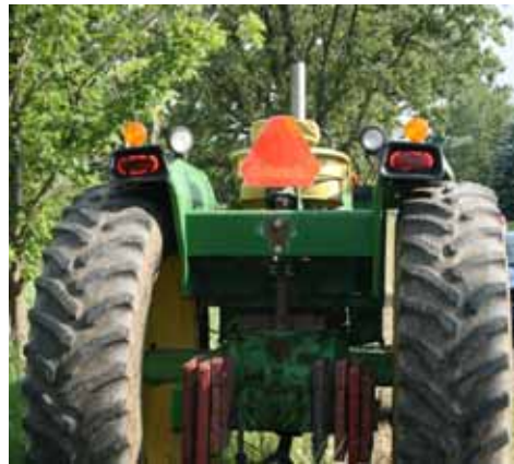
Figure 8. Incident tractor showing lack of PTO master shield and ROPS and faded SMV.

Figure 8 shows the unguarded PTO stub, faded SMV emblem, and lack of a ROPS on the decedent's tractor. Although the lack of and/or condition of these safety features were not a factor in this incident, tractor owners should ensure that shields are re-installed, faded SMV emblems are replaced, and determine if a tractor can be retrofitted with a ROPS.