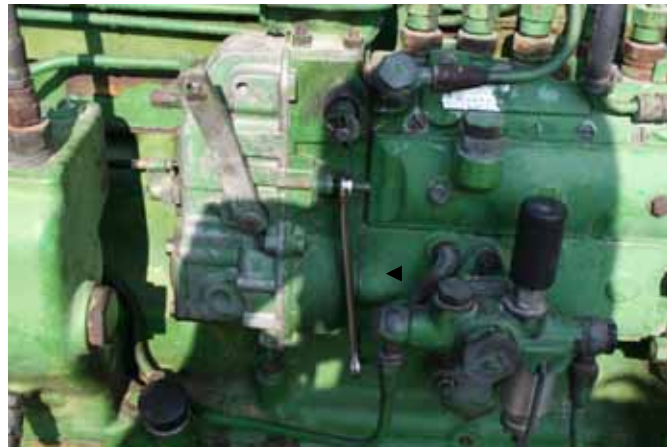
Figure 3. Police re-enactment of work decedent was performing.