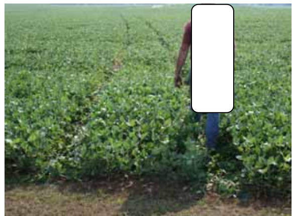
Figure 7. Path of tractor across north/south road and into/out of field

Tire tracks on the floor led out the south door and the tractor began drifting to the southwest into a cornfield, and then arced to the north, crossing the road (north barn door faced this road) and continued into the field across from the barn. The tractor continued its arced path of travel through this field, and