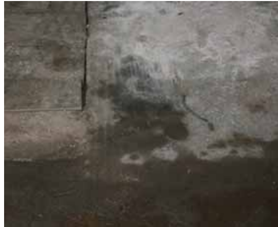
Figure 5. "Spin" marks left by the tractor's rear right wheel

It is unknown if the tractor was in Park or Neutral. It appears that he reached up to activate the throttle. As he reached to pull the throttle back toward him, he faced the right rear tire (Figure 1). Given the configuration of the tractor, he would have been pressed against the rear tire when reaching up to the controls. At some point, he contacted the gear shift lever, pushing it back thus placing the tractor into gear. Because the tractor engine was operating at a high state of idle, the clutch would not need to be depressed to place the tractor in gear. When the tractor was placed into gear, it lurched forward at a high rate of speed leaving spin marks on the barn's concrete floor.