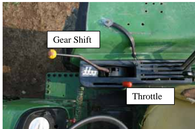
Figure 4. Gear shift and throttle identified. Picture taken from operator's seat.