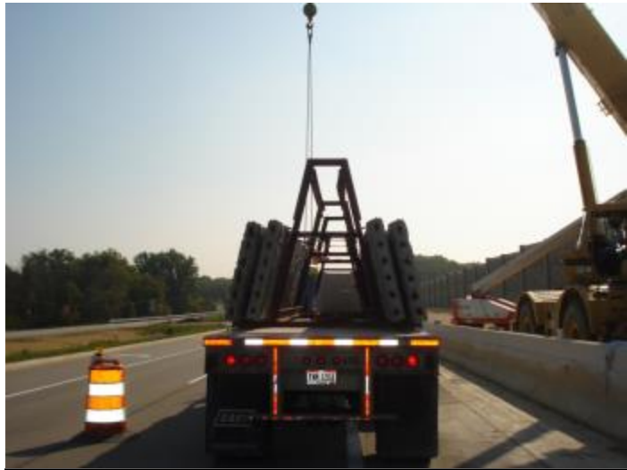
Figure 3. Example of concrete sound panel orientation on A-frames on trailer

The semi-trailer was equipped with two A-frames that carried the precast concrete sound panels (Figure 3). One A-frame was located toward the rear of the trailer and one to the front of the trailer. The A-frames were appropriately secured to the trailer bed. The sides of the A-frames, against which the panels rested, were facing outward; the driver (northern direction) and passenger side (southern direction) of the trailer. The foot of the A-frame supporting the panel involved in the incident was narrower than the bottom of the slab. Additionally, the wood attached to the A-frame stopped short of the bottom of the steel.