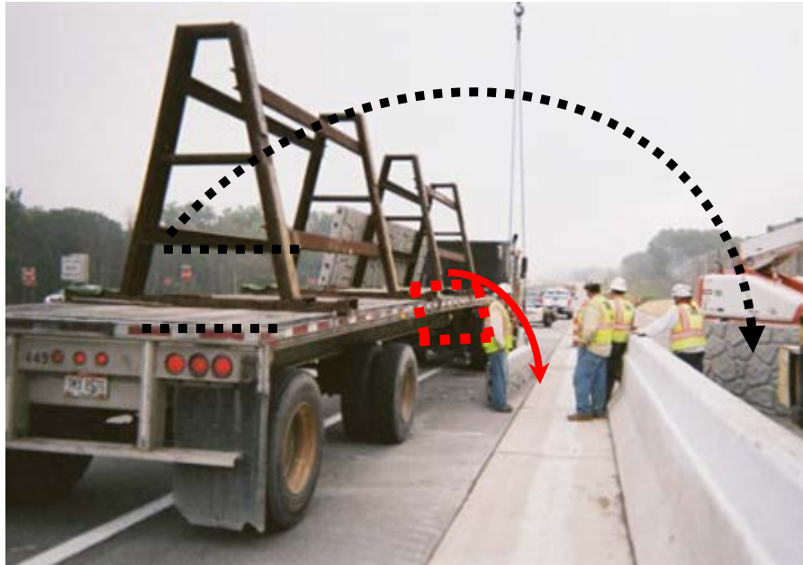
Figure 5. Path of panel being unloaded and position of panel that fell from truck striking decedent

crane operator had unloaded 5 sound barrier panels (unloading sequence unknown) and they had been set into position into the sound barrier wall by a single laborer in the man lift. A single looped tag line approximately 45 feet in length was used. The use of the looped tag line was for the elimination of a second man lift to set the precast panels in place at their final destination. The foreman for the erecting employer stood on the