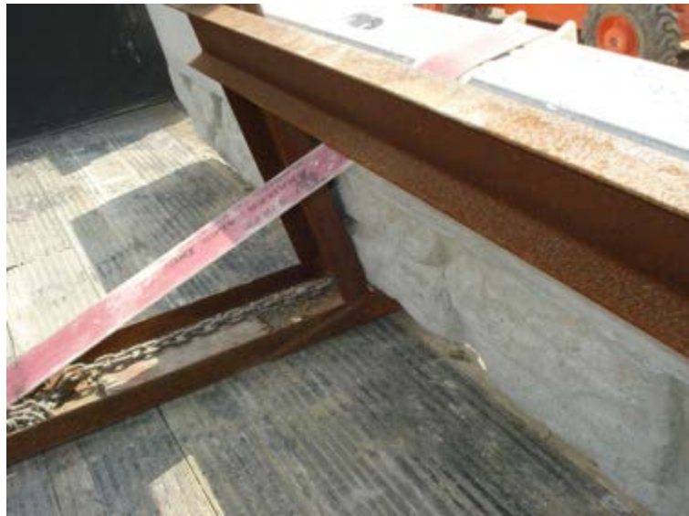
Figure 4. Example of securement method for concrete panel transportation

The keyway on the bottom of the barrier panel that fell caused the bearing surface to become smaller. The A-frames were measured at 12 degrees south to north. The concrete sound panels were located approximately 65 inches above the roadway. An example of panel securement for transportation is shown in Figure 4.