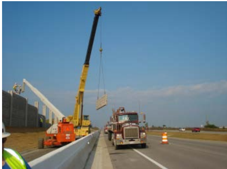
Figure 2. Overview of construction site including example of position of decedent's truck and location of additional company trucks

The site supervisor was not present at the time of the incident.