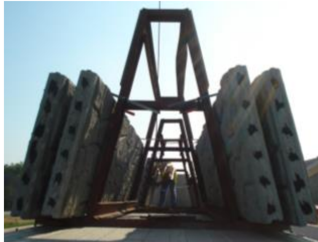
Figure 6. Concrete panel securement with C-clamps, after the incident

MIFACE recommends that during the initial load securement process, transport devices such as shoulder bolts be installed in the panels and rated straps and come-a-longs used to secure each individual panel to the A-frame, either onto welded rings on the A-frame or around the frame itself (Drawing 1).