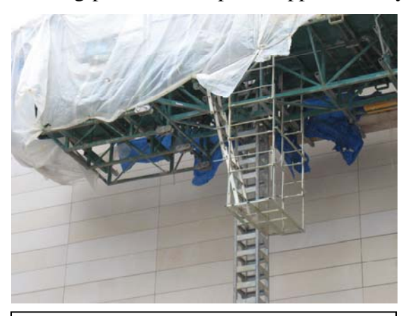
Figure 3. North working plank not fully planked nor guarded

The decedent and his coworker started the Hydro Mobile 2 scaffold and raised the working platform into place, approximately 35 feet above the ground. The decedent and