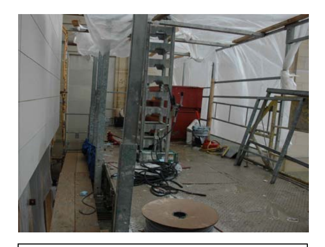
Figure 6. Guardrail installed on south end of working plank after incident

Employees who perform work on a scaffold also are required to be trained by a person qualified in scaffold safety. The training must enable an employee to recognize the hazards associated with the type of scaffold being used and to understand the procedures to control or minimize the hazards. Although the employer had provided ongoing scaffold training in toolbox talks, one of which was held one month prior to the incident, the fatal incident still occurred. Continued reinforcement of the importance of safe work procedures and the expectation (including disciplinary action if necessary) that the procedures will be followed is an important element in the prevention of injuries.