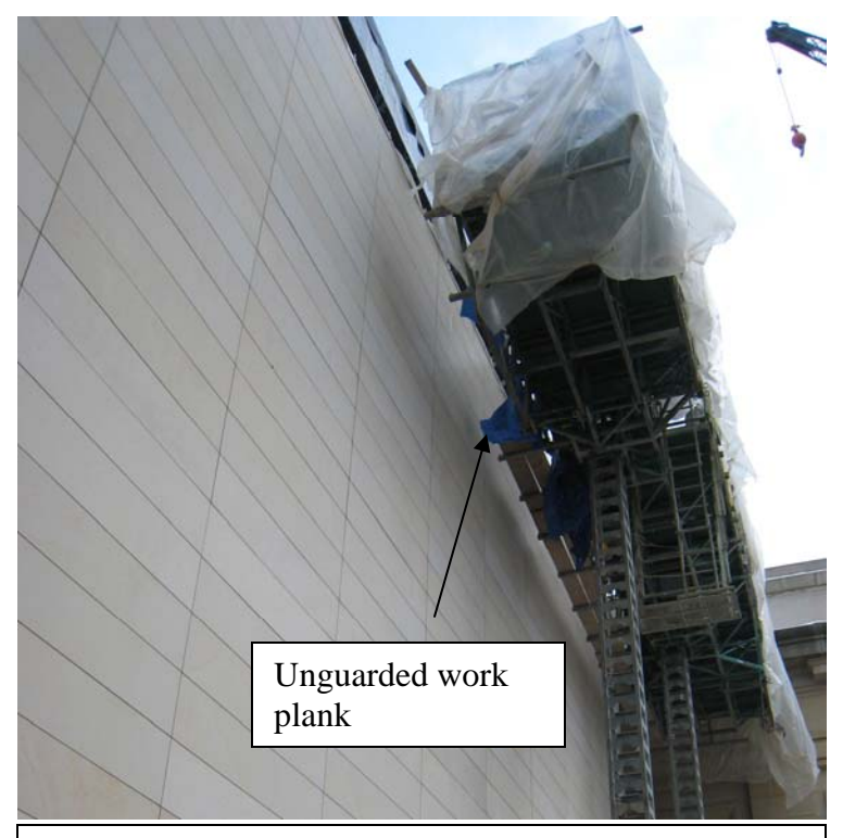
Figure 1. Unguarded north work plank on raised Hydro Mobile 2 scaffold

On the winter of 2008, a 32year-old male journeyman mason died as a result of falling from an unguarded working surface of a Hydro Mobile 2 scaffold raised to 35 feet. The scaffold had recently been lowered and moved to its present location. competent persons erecting the scaffold did not re-install the guardrails at the ends of the working platform the nor install proper planking prior to raising the scaffold. The scaffold was repositioned in a north-south direction and then raised to 35 feet above the ground. The decedent was installing backing rod and his coworker caulking. The two workers worked in a south to