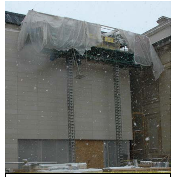
Figure 2. Repositioned Hydro Mobile 2 scaffold

Once the move had been made, the Hydro Mobile 2 was fastened to the building in a north-south position and the work planks reinstalled. Plastic sheeting covered the scaffolding at the top, which had been raised to 35 feet (Figure 2). The working foot planks that were attached to the outriggers did not extend the continuous length of the scaffold thus did not fully plank the scaffold work area (Figures 3 and 4). The work planks were less than six inches away from the construction wall.