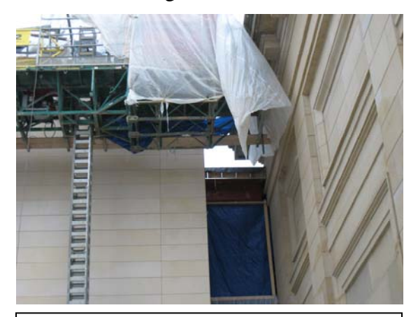
Figure 4. South working plank not guarded

his coworker tore off six blocks and replaced them. They were working from south to north installing backer rod and caulking to re-anchor the block clips. The decedent was installing the backer rod ahead of his coworker who was installing the caulk.