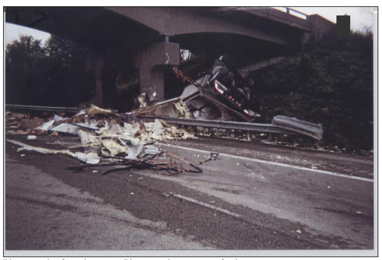
Photograph of crash scene.

Kentucky Fatality Assessment and Control Evaluation Progran Kentucky Injury Prevention and Research Center 333 Waller Avenue