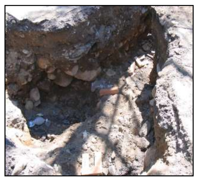
Figure 4: Area of trench collapse Note the large boulders hanging from the than excavation faces and undermined areas on the edge of the trench