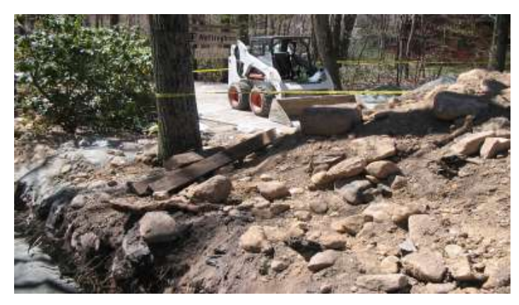
Figure 2: View of the west wall of the excavation south of the "T." Note the boulders and loose rock/dirt on the excavation face as well as the location of the spoils pile within 2 feet of the edge of the trench.

The faces of the trench were vertical. No shoring or benching was used. Large cobbles and boulders and loose rock/dirt were visible on the face of the excavation and were not removed or supported. The pavement above the E and W faces of the excavation had been undermined during excavation activities and no support system was utilized to protect employees from a possible collapse. Pieces of road pavement and asphalt had been undermined during excavation activities in the road in the proximity of the sewer main at the top of the "T." These areas were in plain view and did not have additional support. On the W side of the excavation, loose boulders, rock and debris in spoils piles were located less than two feet from the edge of the trench. (Figure 2) The excavator was positioned adjacent to the N end of the trench, where undermined areas were in plain sight. The N end of the trench, where the victim was installing the sewer tap, also lacked an access ladder or other safe means of entry/egress.