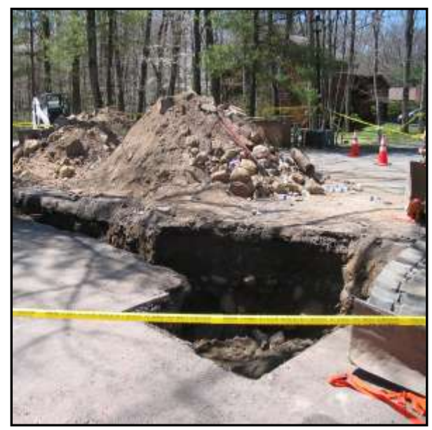
Figure 3: Location of collapse. Note spoils piles and equipment located less 2 feet from the edge of the trench