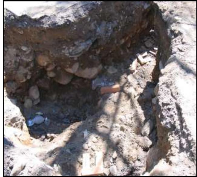
Figure 4: Area of trench collapse Note the large boulders hanging from the excavation faces and undermined areas on the edge of the trench