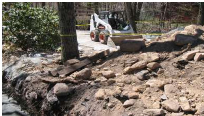
Figure 2: View of the west wall of the excavation south of the “T.” Note the boulders and loose rock/dirt on the excavation face as well as the location of the spoils pile within 2 feet of the edge of the trench.

The faces of the trench were vertical. No shoring or benching was used. Large cobbles and boulders and loose rock/dirt were visible on the face of the excavation and were not removed or supported. The pavement above the E and W faces of the excavation had been undermined during excavation activities and no support system was utilized to protect employees from a possible collapse. Pieces of road pavement and asphalt had been undermined during excavation activities in the road in the proximity of the sewer main at the top of the “T.” These areas were in plain view and did not have additional support. On the W side of the excavation, loose boulders, rock and debris in spoils piles were located less than two feet from the edge of the trench. (Figure 2) The excavator was positioned adjacent to the N end of the trench, where undermined areas were in plain sight. The N end of the trench, where the victim was installing the sewer tap, also lacked an access ladder or other safe means of entry/egress.