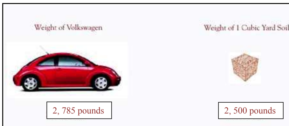
Figure 5: Weight of one cubic yard of soil (courtesy of “Weights of Building Materials, Agricultural Commodities, and Floor Loads for Buildings” standard reference)

The key to preventing a trench accident is not to enter an unprotected trench. When the walls of a trench collapse or cave in, the results are entrapment or struck-by incidents to anyone caught inside, accidents which can occur in seconds. Many workers in a trench are in a kneeling or squatting position that results in little opportunity for an escape. Victims do not need to be completely covered in soil. Even with partial covering, enough pressure is created for mechanical asphyxia in which the weight of the dirt and soil compresses the chest. One cubic yard of soil has an average weight of 2500 pounds (Figure 4), but can vary due to the composition and moisture content.