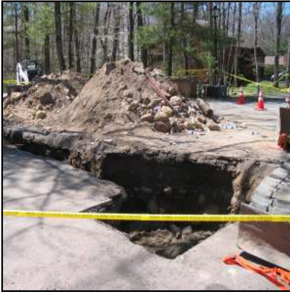
Figure 3: Location of collapse. Note spoils piles and equipment located less 2 feet from the edge of the trench