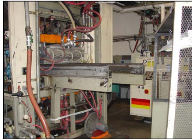
This front view of the plastic thermoformer machine shows where the set-up worker was making adjustments to the top platen, while the machine operator was working in the rear of the machine to adjust the oven. The pneumatic hose on the left of the machine remained energized during the adjustments.

After adjusting the platen stop, the set-up worker yelled “clear” – the signal he regularly used to warn that he was going to activate the pneumatic toggle switch. Although electrical energy had been shut down, the switch remained energized by an independent air supply. The coworker looked through the oven area, and did not see the machine operator (or by a second account, did see the machine operator making final adjustments outside the oven). Other running machinery in the plant made a noisy environment, which made verbal communication between the two workers difficult.