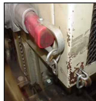
One of the disconnected safety interlocks on the thermoform machine would have prevented start-up if a gate was open.

Training on lockout/tag out procedures should include specific procedures for each machine. Written hazardous energy programs and training must include the manufacturer's operating instructions . A machine operator should be aware of and follow all of the manufacturer's instructions and safety recommendations.