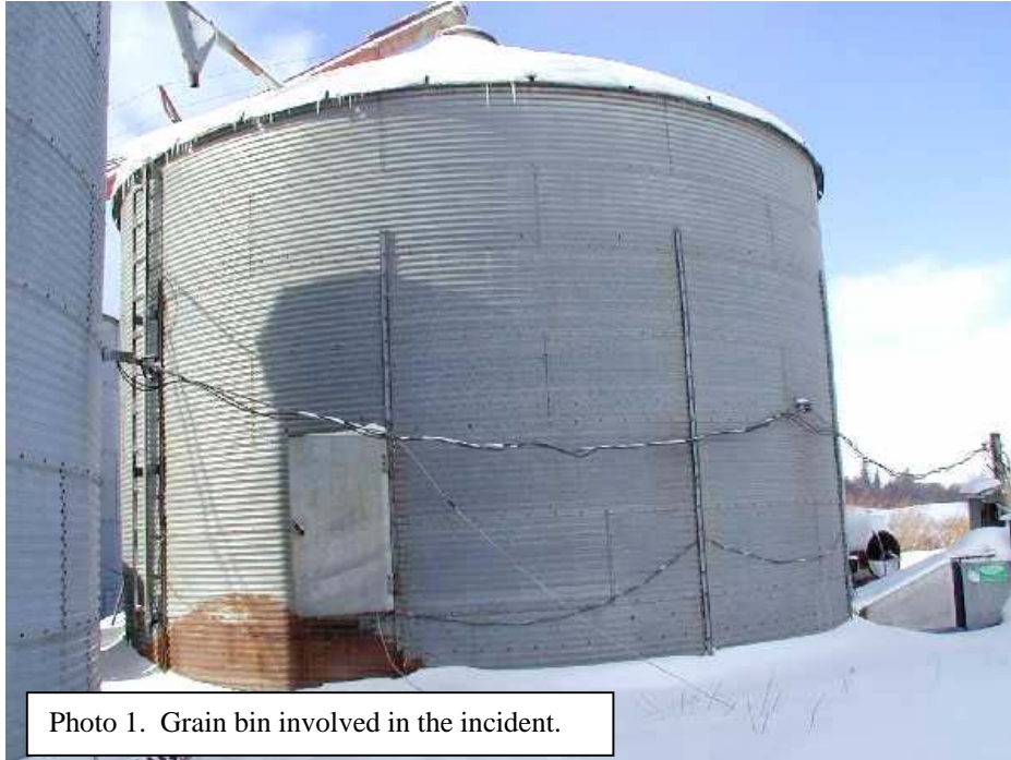
Photo 1. Grain bin involved in the incident.

On November 9 th , 2004, three employees and the farm owner were loading corn from a grain bin into a transport truck in order to transfer the corn into a different bin. The victim was removing the remaining bushels of wheat from the floor of this bin in preparation for the transfer of corn from the first bin. The grain bin where the victim was working was a 1972 Butler grain bin (Photo 1), 30 feet in diameter with a vertical auger in the center of the bin. The auger moved grain up from the center of the bin into a chute which dispensed the grain into a waiting vehicle. The bin also had an approximately 14-foot-long sweep auger. The auger rotated around the circumference of the inside of the grain bin, moving grain from the radius of the bin toward the center at which point the center auger moved the grain vertically upward and out of the bin.