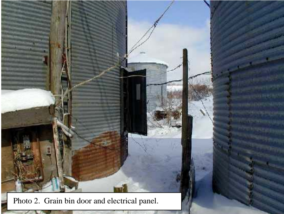
Photo 2. Grain bin door and electrical panel.

remove it from the bin. When a considerable amount was piled against the auger, the worker would go outside the bin and re-energize the electricity to the auger motor which would transport the material up and out of the bin (Photos 2 & 3). This method would require repeated shoveling, sweeping, and re-energizing until all of the remaining grain had been removed from the bin.