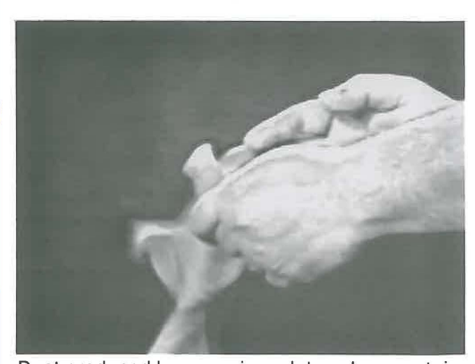
Dust produced by removing a latex glove containing powder.