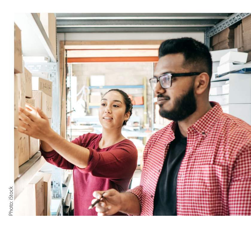
2 | SMALL BUSINESS SAFETY AND HEALTH HANDBOOK

OSHA's Safe + Sound campaign encourages every workplace to have a safety and health program. Through this campaign, OSHA works with NIOSH and other organizations to provide resources to help employers develop safety and health programs and to recognize the successes of these programs.