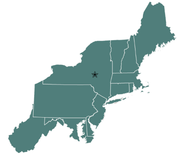
ROPS Retrofits (2,442)

NEC, located in Cooperstown, NY, serves 12 northeastern states