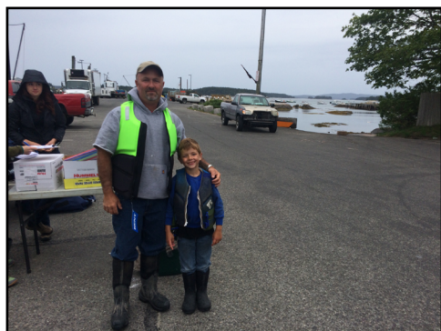
Maine PFD participant with his son