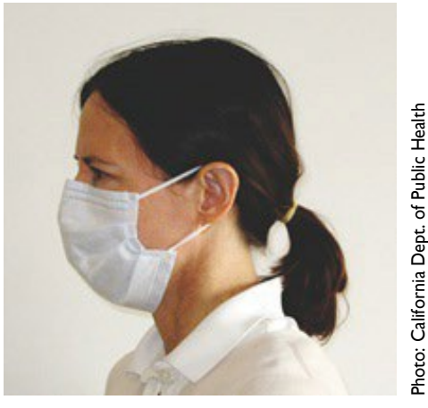
Healthcare personnel wearing a surgical mask.

Respirators are designed and regulated to provide a known level of protection when used within the context of a comprehensive and effective respiratory protection program (see the "Types of Respiratory Protection" section on page 15). For example, filtering facepiece respirators are designed to seal tightly to the face when the proper model and size is selected for the individual by using a fit test procedure. The wearer can then be assured that inhaled air is forced through the filtering material, which allows contaminants to be captured and reduces exposure to both large droplets and small infectious particles.