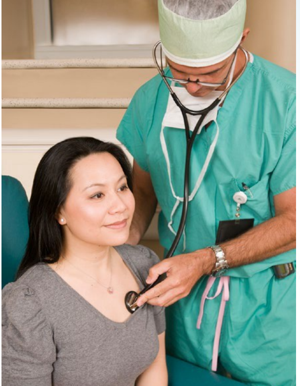
Physician evaluating a worker for respirator clearance.

Based on the answers to the questionnaire, as well as on a physical exam or any other tests the PLHCP deems necessary, the PLHCP must make a determination as to whether the individual can safely wear the respirator. Information that is useful for the medical evaluation of respirator