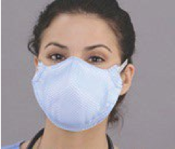
Worker wearing a filtering facepiece air-purifying respirator.

Powered air-purifying respirators (PAPRs) may be used in healthcare when aerosol-generating procedures are performed, by hospital first receivers, or when the respirator user is not able to wear a tight-fitting respirator. PAPRs have a battery-powered blower that forces air in the room through filters (for particles) \alpha cartridges (for gases or vapors) to clean it before delivering it to the breathing zone of the wearer. High-efficiency (HE) filters are the