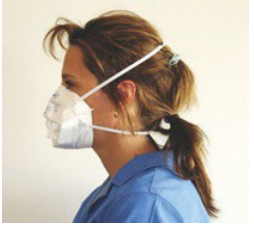
Healthcare personnel wearing a filtering facepiece respirator.