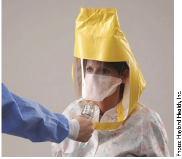
Worker receiving qualitative fit testing.

Describe your procedures for coordinating fit testing for your staff, as well as the specific, detailed fit testing protocol that will be used.