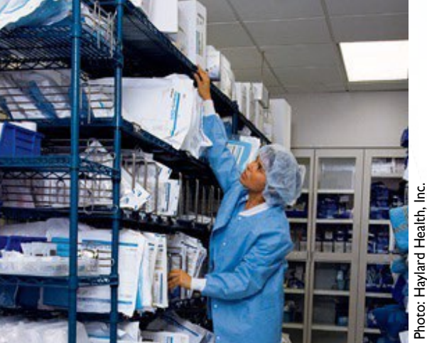
Healthcare personnel in a stockroom.

procedures will be done by the respiratory therapy department, the PAPRs will be stored there. Some hospitals issue PAPR hoods to individuals who are responsible for maintaining them, while central supply or materials management is responsible for decontaminating PAPR motors and blower units and charging batteries. Whatever you decide works best for your facility should be described here.