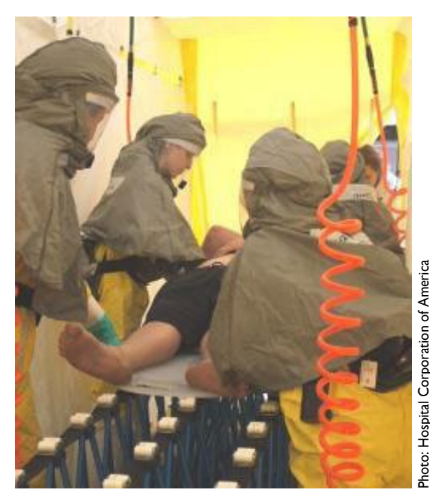
Workers wearing powered air-purifying respirators while treating a patient.

You may also have employees who have been designated first receivers for emergency response purposes. These employees are expected to decontaminate or provide initial care for victims of a biological or chemical emergency. When their exposures may be to unknown substances, hospital first receivers are required to have special training and use the most protective type of PAPR approved by NIOSH for chemical, biological, radiological, and nuclear (CBRN) exposures. These PAPRs have a full facepiece, or a hood or helmet, and a combination HE filter and chemical cartridge. They must be a type that has an APF of 1,000, meaning that the PAPR will reduce the exposure of the wearer to 1/1000th of the airborne contaminant concentration. Refer to OSHA Best Practices for Hospital-Based First Receivers of Victims from Mass Casualty Incidents Involving the Release of Hazardous Substances for more information on PPE for first receivers.