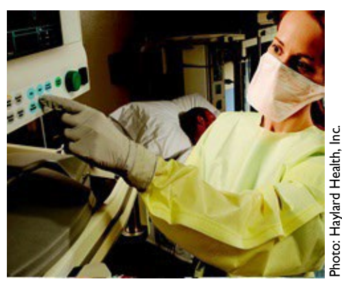
Filtering facepiece respirators being used in healthcare workplaces.