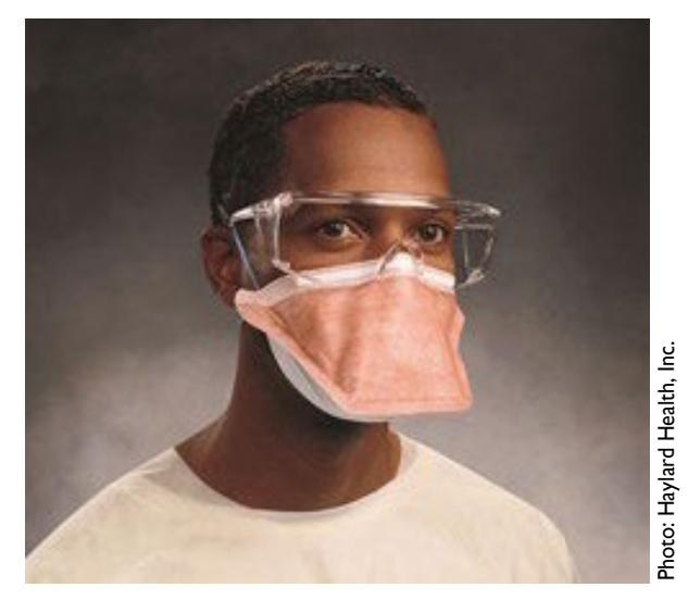
Worker wearing a filtering facepiece respirator and eye protection.

via the airborne route. However, for many other pathogens, there is less information available than for TB on how long they remain viable and infectious while airborne.