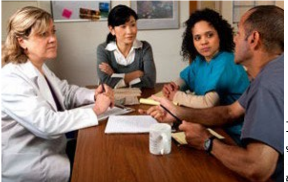
Healthcare personnel evaluating their RPP.

Any deficiencies in the implementation of policies and procedures that are discovered as a result of the evaluation must be corrected in a timely manner. In some cases, this might mean revising the written program to conform to actual practices as long as the procedures being followed comply with the standard. In other cases, it might mean retraining personnel on