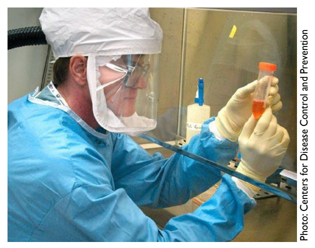
Laboratory worker wearing powered air-purifying respirator

Your written RPP should cover laboratory workers and specify the level of respiratory protection required for different pathogens or job tasks, in accord with the biosafety plan and other written lab operating procedures.