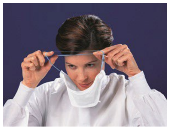
Worker donning a filtering facepiece respirator.

can cause an increased resistance to breathing or a build-up of carbon dioxide inside the facepiece. This can lead to medical complications in individuals for whom it may not be safe to wear a respirator. It may also be unsafe for someone with moderate to severe claustrophobia to wear a respirator. Medical evaluations must be provided by the employer during work time and at no cost to the employee.