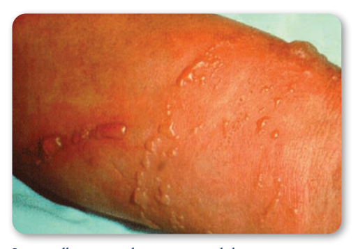
Images illustrating skin injuries and diseases were selected from Occupational Dermatoses—A Program for Physicians. Additional information about this slideshow is available at http://www.cdc.gov/niosh/topics/ skin/occderm-slides/ocderm.html.

Permanent damage may also occur to body organs or systems as a result of chemical exposure to the skin. For example, exposure to certain solvents can result in liver damage.