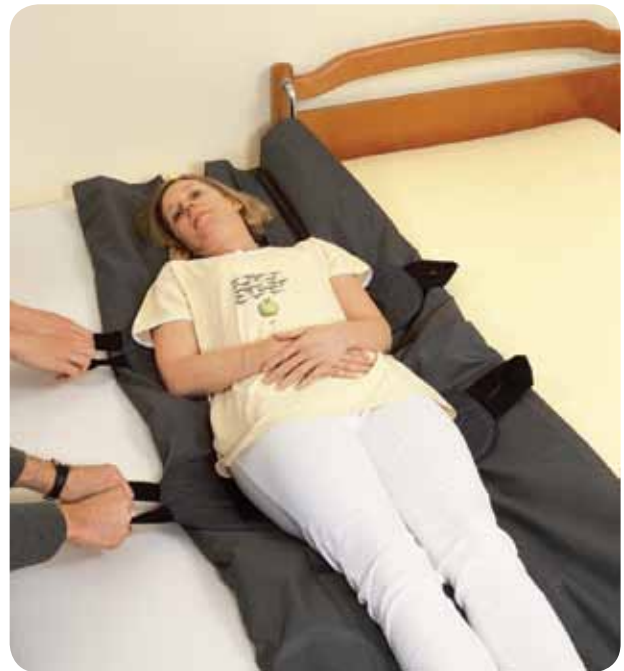
Figure 2.2. Slide/draw sheet