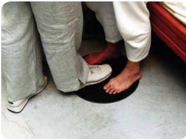
Figure 2.9. Rotation disk