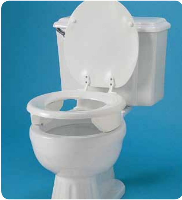
Figure 2.7. Raised toilet seat