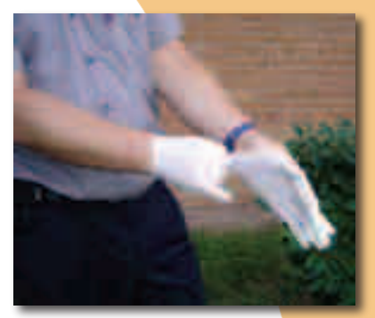
Wear gloves if you must handle dead animals.

Testing for WNV infection is available. No vaccine is currently available to prevent WNV infection in humans.