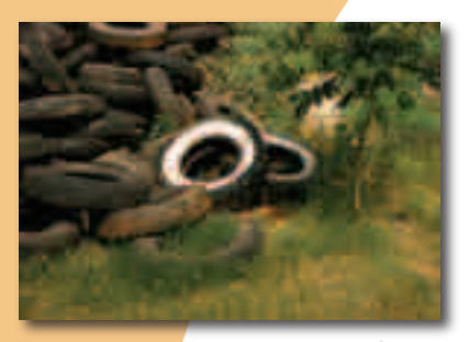
Tires provide breeding sites for mosquitoes.