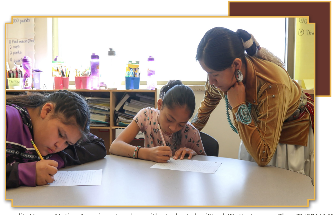
Photo credit: Young Native American teacher with students by iStock/Getty Images Plus: THEPALMER