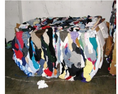
Photo 1: A typical bale of used clothing weighing approximately 730–750 pounds and measuring approximately 48 by 24 by 60 inches.

Investigators for the Washington State Division of Occupational Safety and Health (DOSH) and WA FACE investigators were unable to determine why the stacked bales fell. During the DOSH investigation, the incident forklift operator and the two other company forklift operators were interviewed. The incident forklift operator stated that the incident bales were baled before they arrived at the warehouse. Bales are secured with either metal straps or twine. Like all arriving bales they were weighed and visually assessed for integrity. The incident bales appeared to him to be well constructed