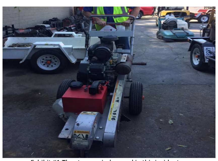
Exhibit #1.The stump grinder used in this incident.