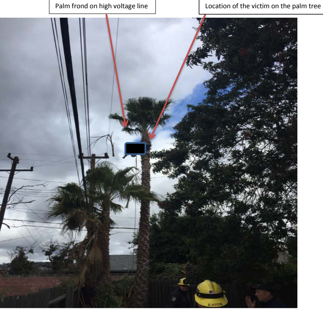
Exhibit #1: The palm tree involved in the incident, and its close proximity to the high voltage electrical lines. Photo used with permission.