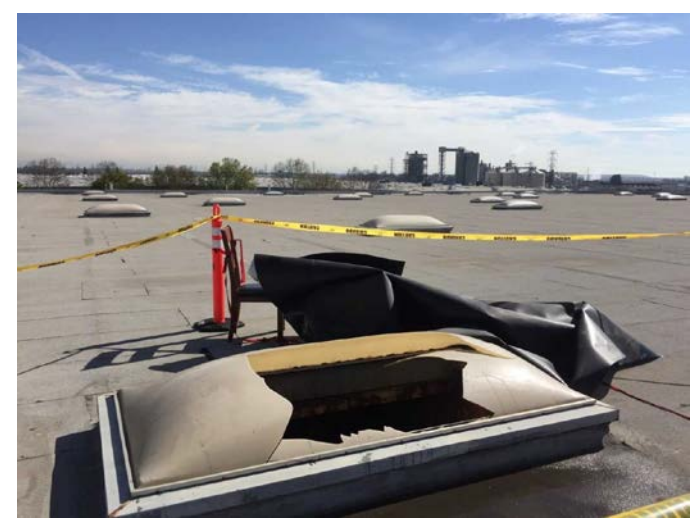
Exhibit 4. The skylight the victim fell through.