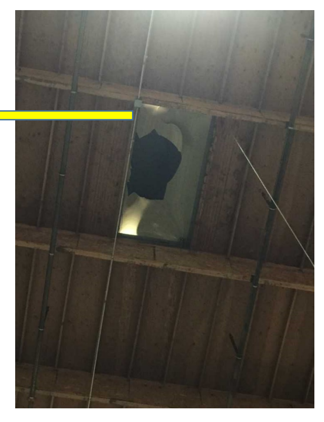
Exhibit 6. Close-up of broken skylight from inside the warehouse.