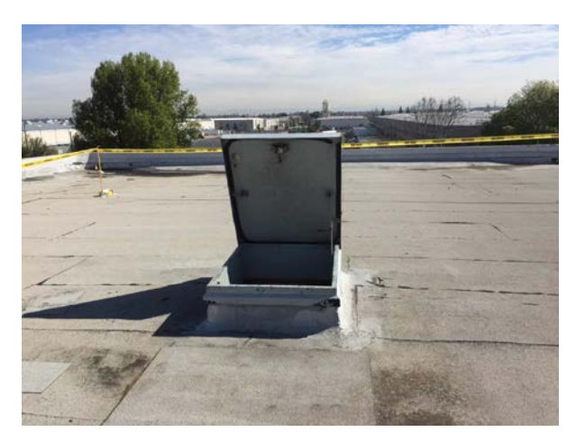
Exhibit 3. The entrance to the roof.