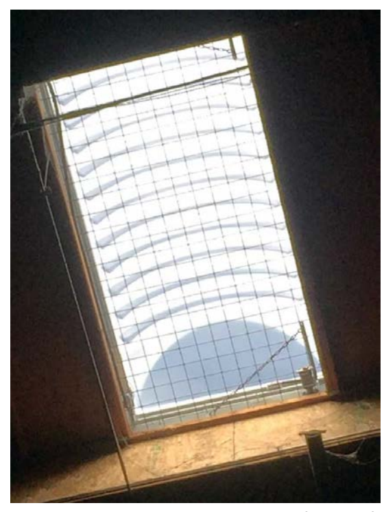
Exhibit 7: Skylight with screen, installed after the fatality.