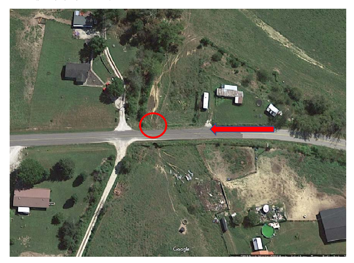
Photo 3: Aerial view of crash site. Circled area shows final resting spot of the overturned truck. Arrow shows direction of travel