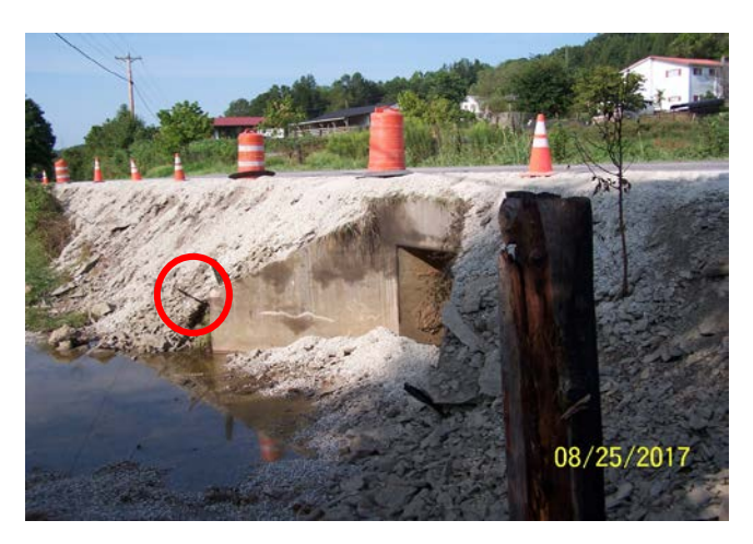
Photo 2: Rebar that the fuel tank struck.