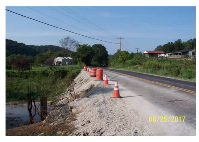
Photo 1: Embankment at the crash site. Barrels and cones added post-incident.