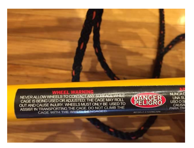
Figure 4 – Warning label on the wheel lift assembly lever.