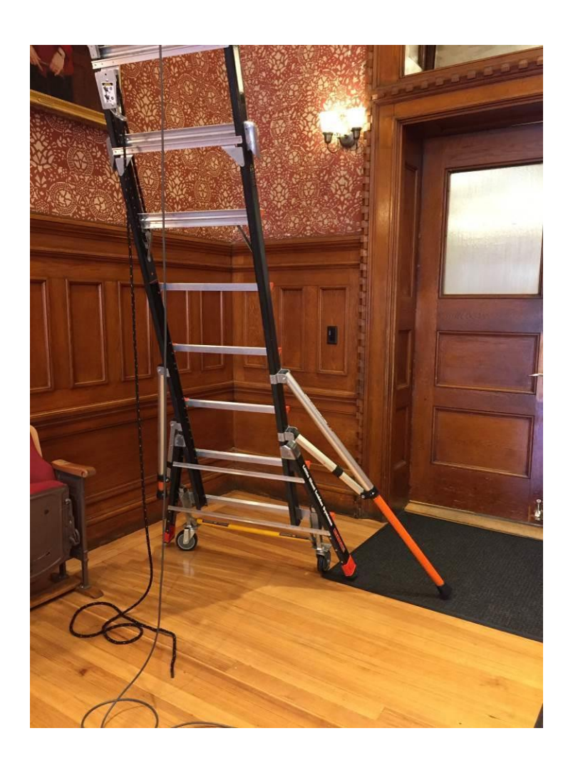
Figure 3 – Platform ladder with one wheel lift assembly engaged and one outrigger deployed