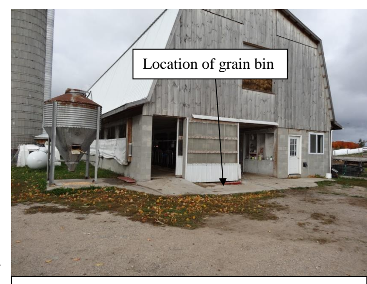
Figure 2. View of barn looking west

MIFACE learned about this incident from a newspaper clipping. The MIFACE researcher contacted the county's MSU Extension agent, who contacted the family of the deceased. One of the decedent's family members agreed to be interviewed by the MIFACE researcher. The MSU Extension agent accompanied the MIFACE researcher to the family member's home. The family member accompanied the MIFACE researcher and MSU Extension agent to the decedent's farm. During the writing of this report, the death certificate, police and medical examiner reports, and the MIOSHA compliance file were