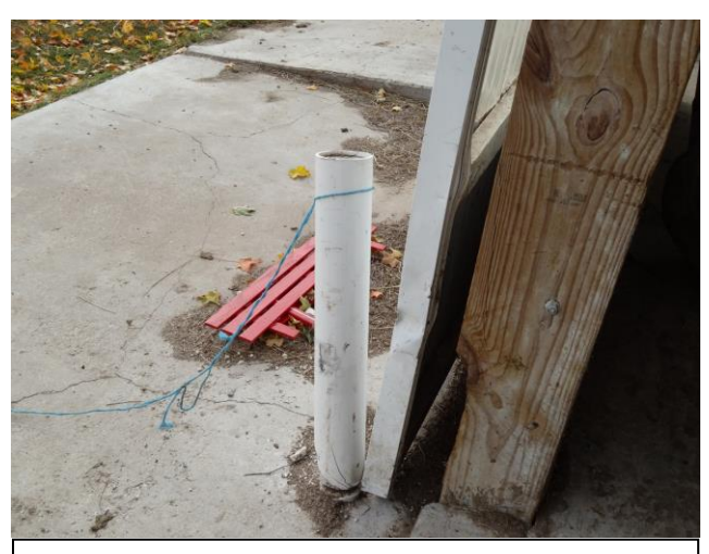
Figure 4. Damaged barn frame and bumper post

For reasons unknown, while the decedent was shoveling the second load of manure into the spreader, something startled one or both of the horses. The family member hypothesized that something specifically startled the younger horse. Both horses bolted of the barn. The young horse pulled to the right (south) causing damage to the barn frame and the bumper post next to the barn access (See Figure 4). Both damage sites had manure on them. Both horses and the trailing manure spreader continued to run south around the concrete pad with the unsecured grain bin. It is unclear whether the experienced horse, manure spreader or both