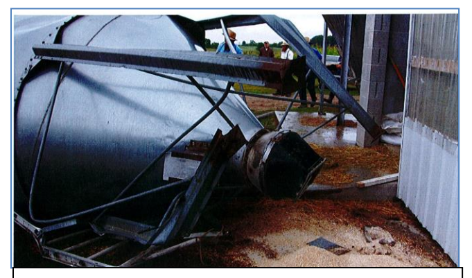
Figure 5. Overturned grain bin

All grain bins should be anchored to the ground to minimize overturn caused by high winds or other outside forces, such as being struck by machinery or, as in this case, a horse and/or manure spreader. It is important to anchor every leg of a hopper bottom bin. To do so, when the bin is placed on a concrete pad, use a leg anchor or similar mechanism for each leg. Leg anchors attach to the bin leg and have anchor bolts drilled into the concrete pad to provide stability. If