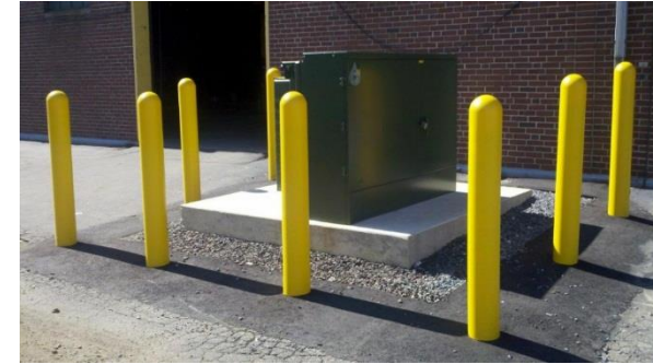
Figure 6. Example of bollard use.

MIFACE recommends that farm operations identify "lanes of travel" and install barriers to protect vital assets, such as buildings, storage units, etc. from damage. One low cost method of barrier protection is a bollard, which is a sturdy, short, vertical steel post that creates a protective