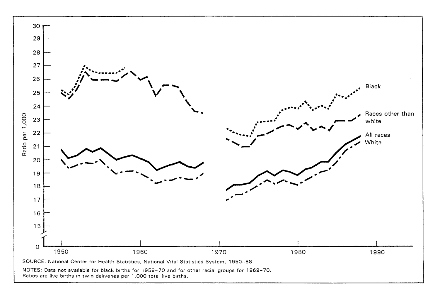
Figure 1. Twin birth ratios by race of child: United States, 1950-88

During all years for which data are available, the twinning ratio for black births exceeds the ratio for white births. In 1988, the ratio of 25.4 for black births was 19 percent higher than the ratio of 21.4 for white births. The racial differential has narrowed considerably since 1971, when the black ratio exceeded the white ratio by 32 percent (table 1). The narrowing of the racial differential is due to the more rapid increase in twinning incidence for white births than for black births (26 percent and 13 percent, respectively).