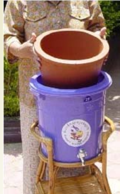
Placing the ceramic pot in a receptacle

One of the largest ceramic filtration programs is in Cambodia, where two NGOs both worked with PFP to establish filter factories. Resources Development International distributes the filters through unsubsidized direct sales, distribution through local vendors, and community-based subsidized programs. International Development Enterprises distributes the filters nationally through vendors. Both NGOs sell filters to government agencies and other NGOs. The project has successfully distributed over 200,000 filters and has been extensively studied.