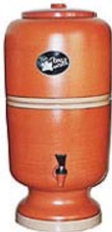
Commercially available ceramic filter system Stefani Australasia

Locally manufactured ceramic PFP-design filters range in cost from $7.50-$30. Distribution, education, and community motivation can add significantly to program costs. Ceramic filter programs can achieve full cost recovery (charging the user the full cost of product, marketing, distribution, and education), partial cost recovery (charging the user only for the filter, and subsidizing program costs with donor funds), or be fully subsidized such as in emergency situations. If a family filters 20 liters of water per day (running the filter continuously) and the filter lasts 3 years then the cost per liter treated (including cost of filter only) is 0.034-0.14 US cents.