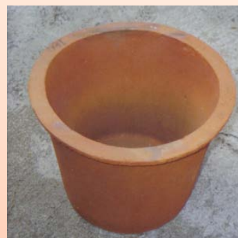
The Potters for Peace filter locally produced in Nicaragua

Ceramic filtration is most appropriate in areas where there is capacity for quality ceramics filter production, a distribution network for replacement of broken parts, and user training on how to correctly maintain and use the filter.