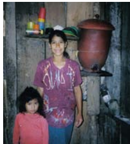
Family using a ceramic filter