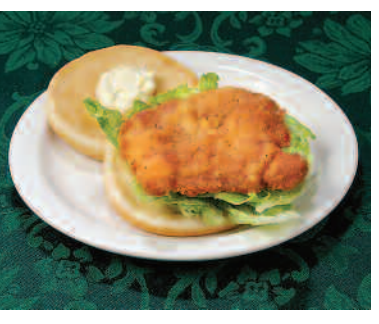
Fried chicken sandwich