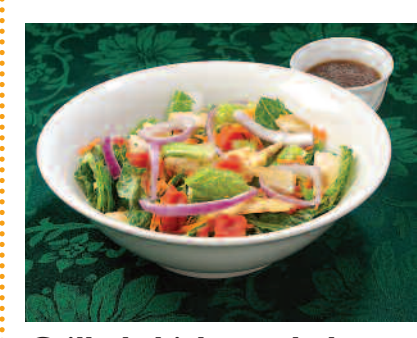
Grilled chicken salad with low-fat dressing

2 cups lettuce, 2 oz. grilled chicken breast, 2 tbsp. light balsamic vinaigrette dressing = 178 calories