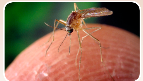
Female mosquito before a blood meal.