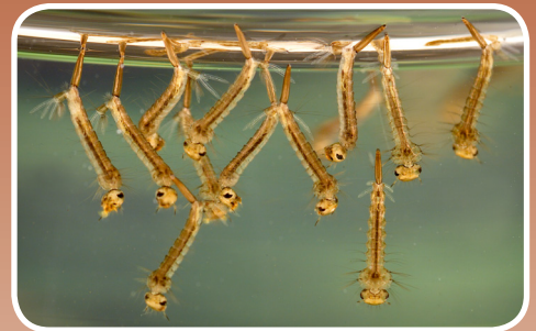
Larvae in the water.