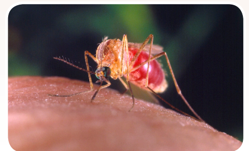
Female mosquito after a blood meal.