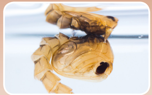
Pupae in the water.