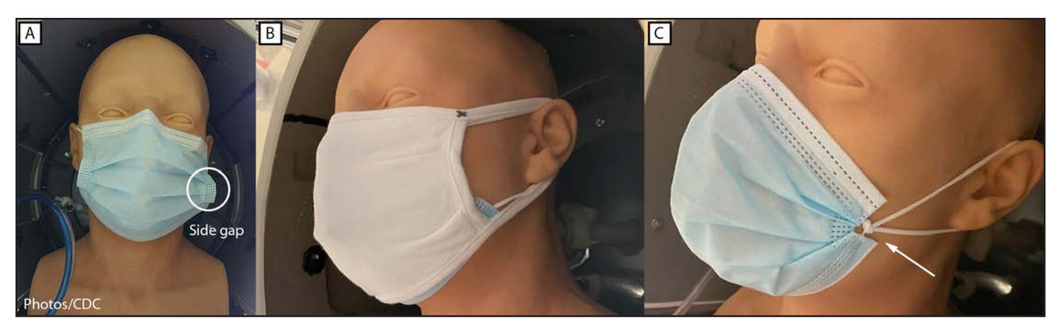
FIGURE 1. Masks tested, including A, unknotted medical procedure mask; B, double mask (cloth mask covering medical procedure mask); and C, knotted/tucked medical procedure mask

These laboratory-based experiments highlight the importance of good fit to maximize overall mask performance. Medical procedure masks are intended to provide source control (e.g., maintain the sterility of a surgical field) and to block splashes. The extent to which they reduce exhalation and inhalation of particles in the aerosol size range varies substantially, in part because air can leak around their edges, especially through the side gaps (9). The reduction in simulated inhalational exposure observed for the medical procedure mask in this report was lower than reductions reported in studies of other medical procedure masks that were assessed under similar experimental conditions, likely because of substantial air leakage around the edges of the mask used here (10). In