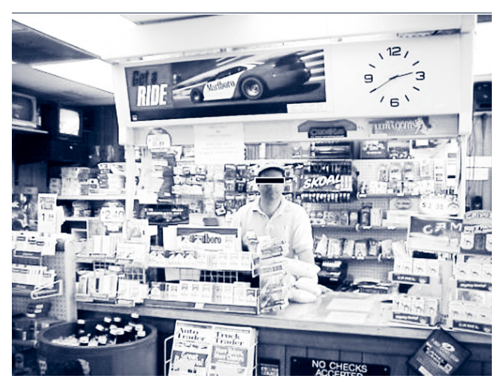
Photo/Battelle Centers for Public Health Research and Evaluation, 1999