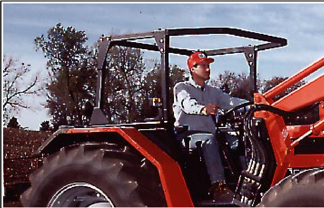
FIGURE 1. Rollover protective structure on a farm tractor

employers to provide ROPS and seatbelts for all employee-operated tractors † manufactured after October 25, 1976 (2). Although virtually all tractors sold after 1985 have been equipped with ROPS, farms with <11 employees are not subject to OSHA inspection or enforcement, and farms managed by family members with no other employees are not required to comply with OSHA standards; in Kentucky, 94% of the farms are family-owned businesses with <11 employees (5). The median age of tractors investigated in this report was 23 years. One fatal tractor rollover in this study involved a 1979 tractor manufactured without ROPS. Because it was purchased for use on a family farm without employees, it was not subject to the ROPS standard. The cost to retrofit tractors manufactured before 1975 ranges from $400 to $1800, and economic constraints associated with farms in Kentucky limit the feasibility of appropriately modifying all tractors.