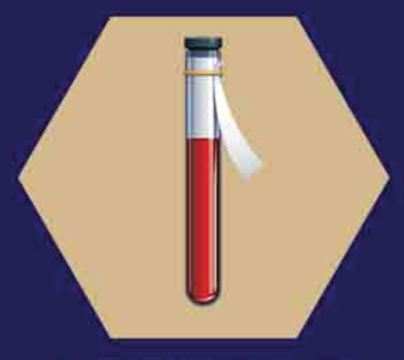
INDIVIDUALS TESTED FOR HIV EVERY YEAR