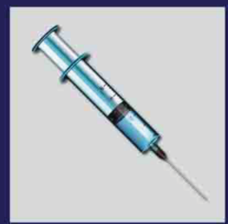
83% OF CHILDREN IMMUNIZED AGAINST MEASLES