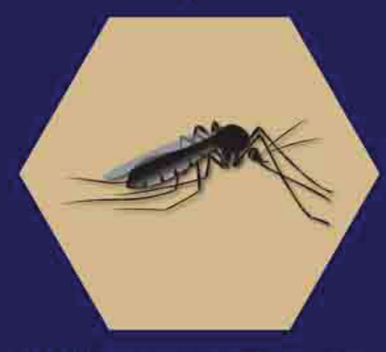
RAPID DIAGNOSTIC TESTS FOR MALARIA PROCURED