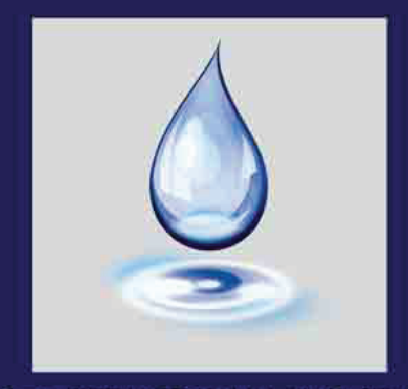
97% REDUCTION IN CHOLERA CASES SINCE EARLY 2011