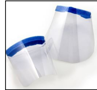
Eyes + Nose + Mouth