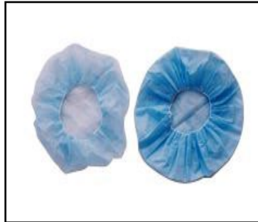
Head + hair