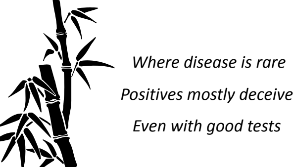
Fig. 4.3. Haiku to diagnostic testing.

Good tests have markedly different predictive values depending on the setting of use (Table 4.1). When the pre-test probability is 40%, the predictive values of both negative and positive results are very high (99% and 97%, respectively). However, when the pretest probability is low, most positive test results are false positives (67%). Clinicians are currently ordering an extraordinary number of diagnostic tests for Lyme disease – more than 3.4 million tests annually, as noted above. It is critically important to the well-being of patients that tests only be used when the predictive value of a positive result is high (Fig. 4.3).