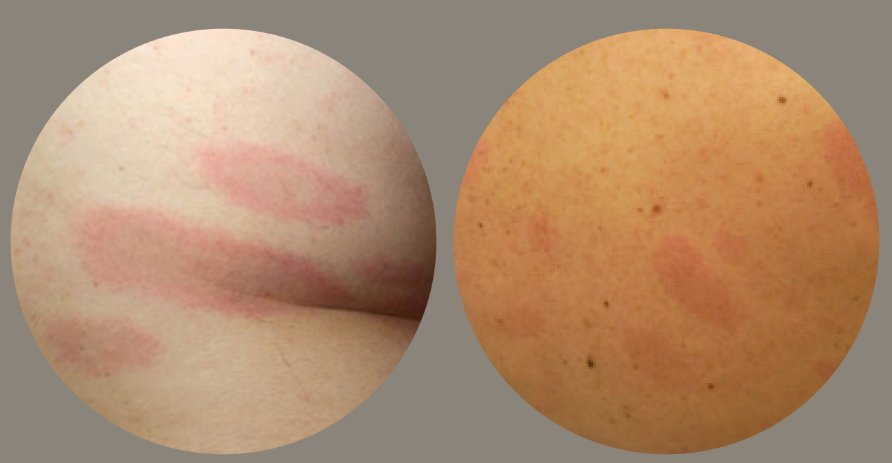
More than one rash