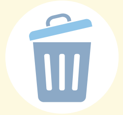
Dispose of Gown & Gloves in Room

Use EBP during high-contact care activities for residents with: