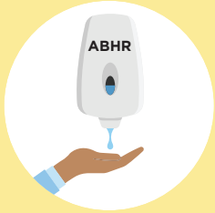
Perform Hand Hygiene